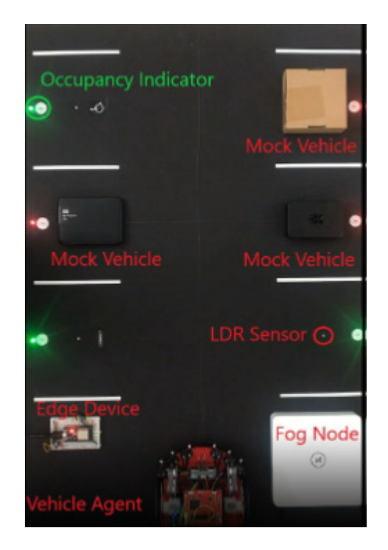
Figure 2: Model Parking Structure

Figure 1: Hardware-in-the-loop Structural Diagram