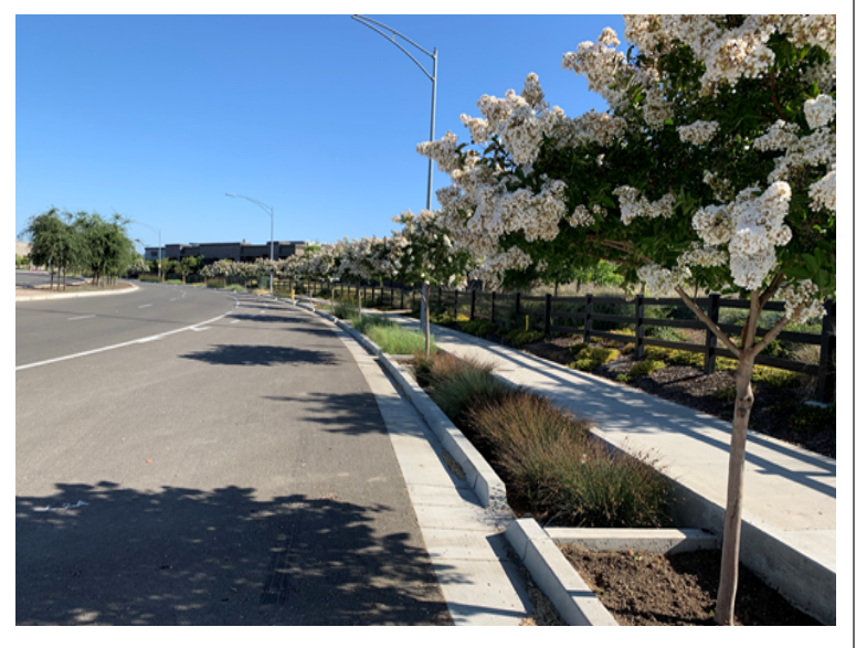
Image 2: Biostrips and Street Trees Along Cherry Avenue in San Jose, CA

Image 1: Recently Installed Elm Trees and Biostrips Along the East Side of San Pablo Avenue Between Lincoln Avenue to Eureka Avenue Looking North in El Cerrito, CA