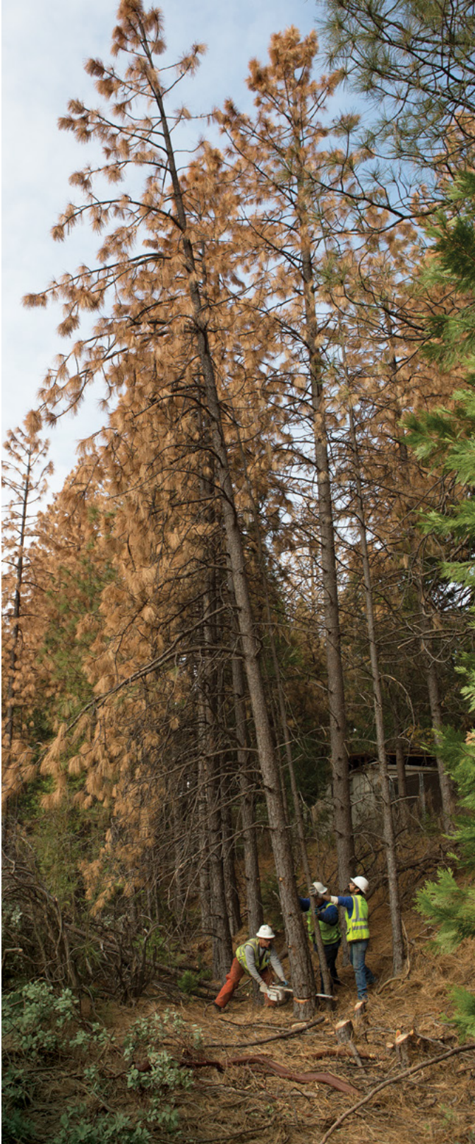
Only certified arborists and licensed foresters can be hired to identify and target trees, so contractors doing the work only remove those specimens. Above, contractors remove trees in December 2016 along U.S. Highway 50 in El Dorado County, near Pollock Pines.