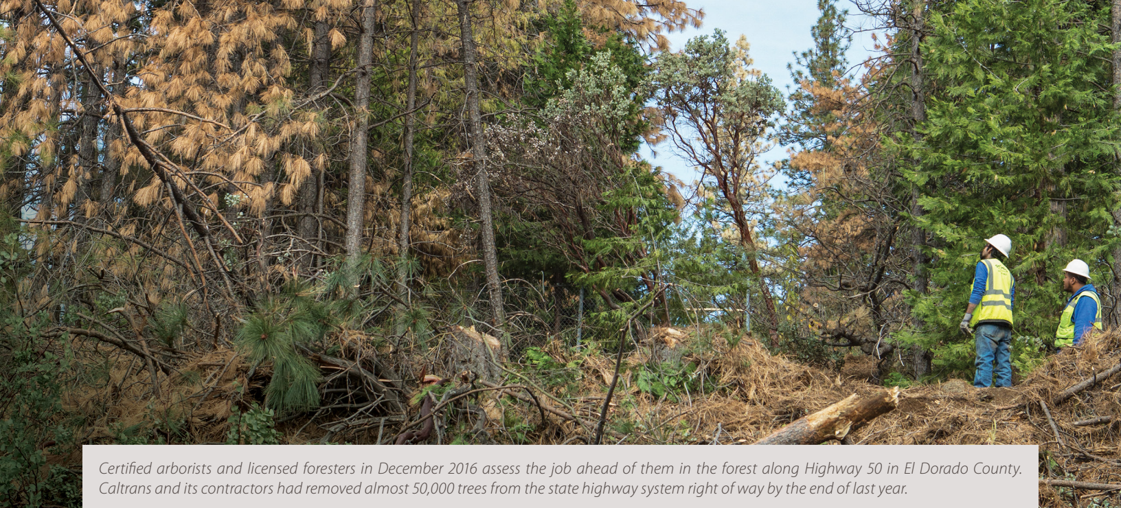
Certified arborists and licensed foresters in December 2016 assess the job ahead of them in the forest along Highway 50 in El Dorado County. Caltrans and its contractors had removed almost 50,000 trees from the state highway system right of way by the end of last year.

Task force members still have an enormous and growing challenge ahead. This disaster will likely continue to unfold for another decade as trees continue to die.