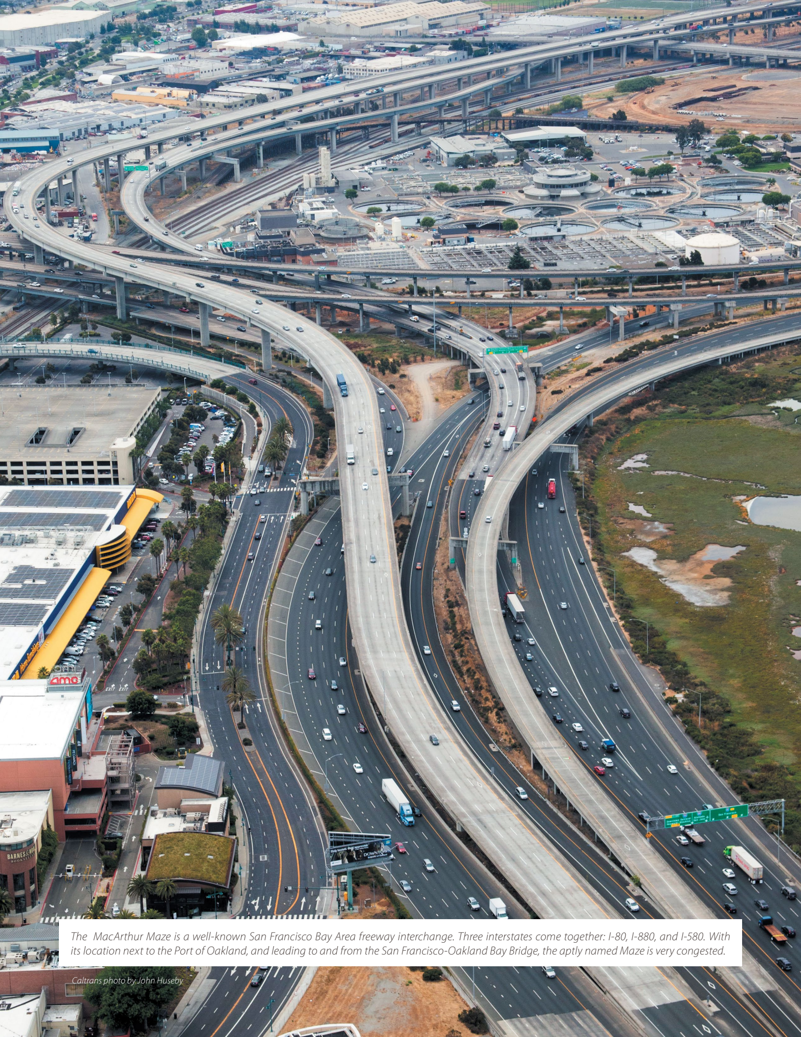
The MacArthur Maze is a well-known San Francisco Bay Area freeway interchange. Three interstates come together: I-80, I-880, and I-580. With its location next to the Port of Oakland, and leading to and from the San Francisco-Oakland Bay Bridge, the aptly named Maze is very congested.