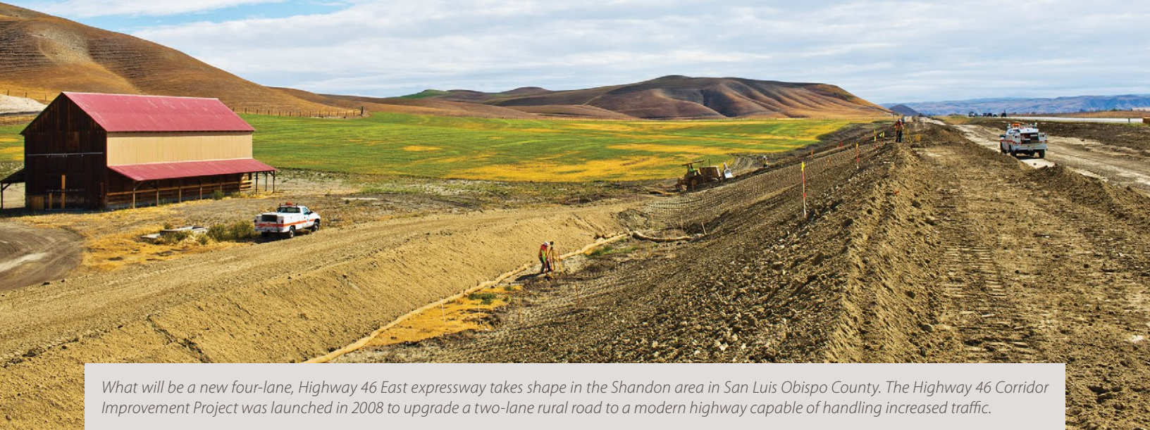
What will be a new four-lane, Highway 46 East expressway takes shape in the Shandon area in San Luis Obispo County. The Highway 46 Corridor Improvement Project was launched in 2008 to upgrade a two-lane rural road to a modern highway capable of handling increased traffic.