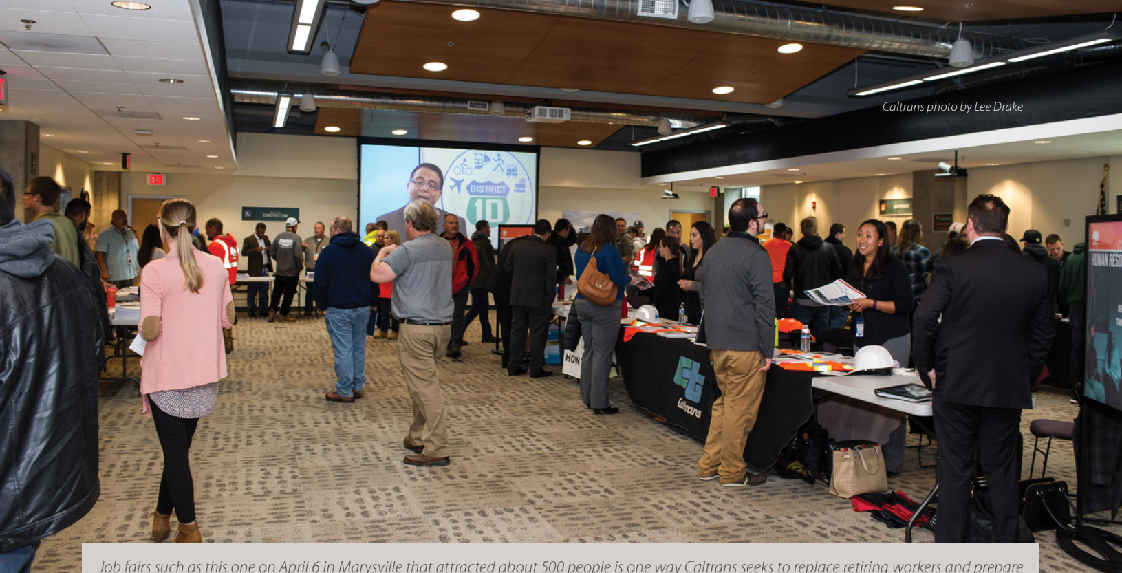
Job fairs such as this one on April 6 in Marysville that attracted about 500 people is one way Caltrans seeks to replace retiring workers and prepare for an expanded workload from SB 1. Caltrans is hosting 10 of these events in 2018. For every five people hired by Caltrans in 2017, four retired.