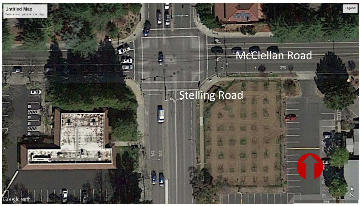
Figure 2: Intersection configuration before improvements (Image date: February 2014)

Because of State Route 85 freeway and the parallel railroad tracks, there are few east-west bike routes connecting to west Cupertino (see Figure 1). McClellan Road is one of the east-west bike routes and is also a major access route to multiple schools, parks and campuses in west Cupertino. Bicyclists traveling northbound on the Stelling Road bike lanes must traverse two lanes of traffic to access the left turning lane to westbound McClellan Road (see Figure 2). This movement places bicyclists in conflict with through moving vehicles.