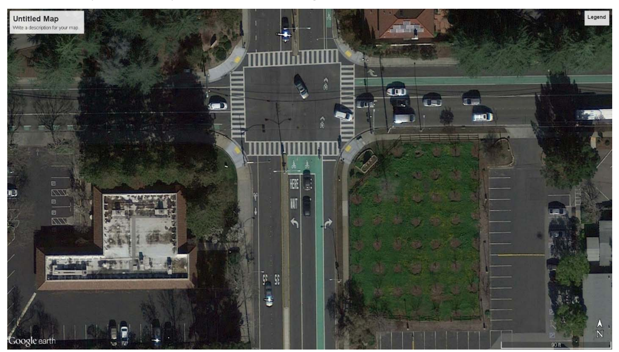
Figure 4: Installed Bicycle Box (Image date: January 2016 - Immediately post construction)

The installed layout of the bicycle box is illustrated in Figure 4.