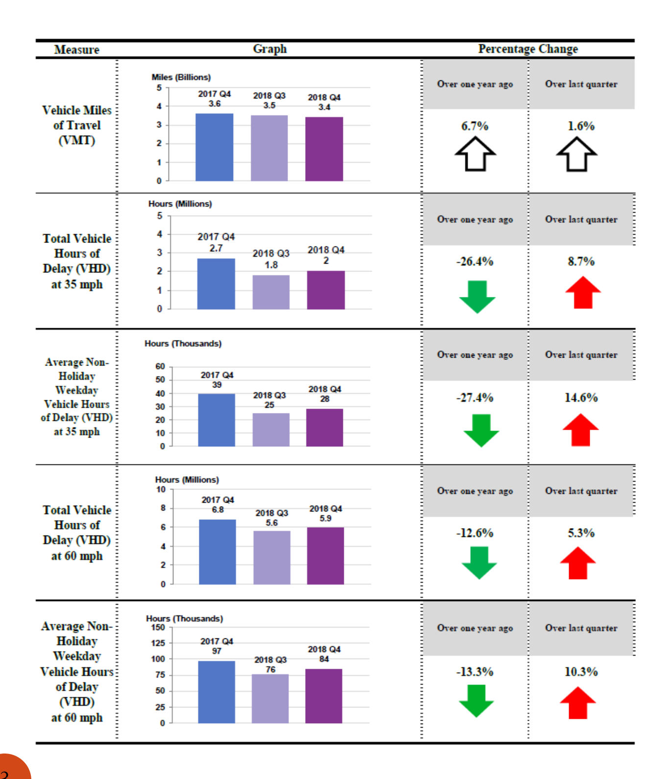
2018 Q4 Quarterly Mobility Statistics District 12