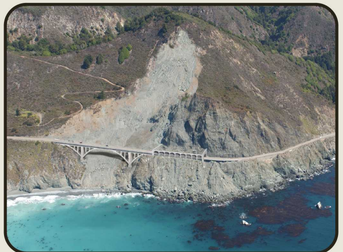
Bridge & Rock Shed Simulation