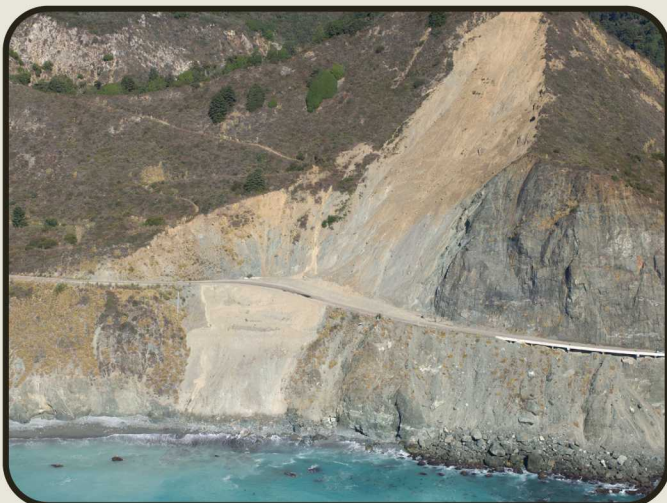
Pitkins Curve Slide / Rain Rocks Slide